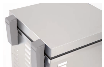
Hinged covers with noise protection