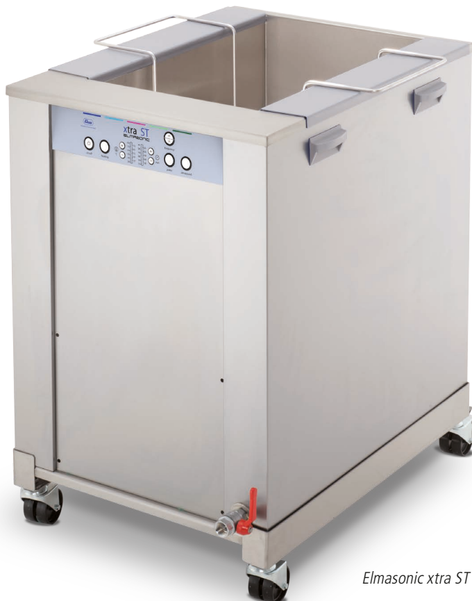
Elmasonic xtra ST 1900S