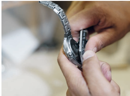
Cleaning in watch manufacture (e.g. bottom cases, watch straps, etc.)