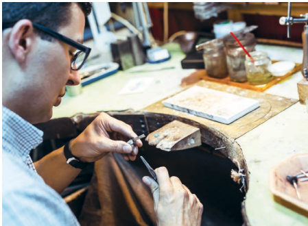
Cleaning in the jewellery industry (e.g. necklaces, earrings, bracelets, rings, etc.)

Elmasonic xtra ST devices are rated for continuous operation under the highest operational demands. The tanks are made of special stainless steel, which makes them robust with a long service life. In single-shift operation, they are guaranteed a warranty period of three years.