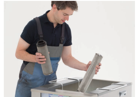
Industrial parts cleaning in workshops, production and servicing as well as for overhaul cleaning