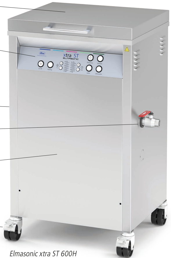
Elmasonic xtra ST 600H

High mobility , since devices are on industrial rollers