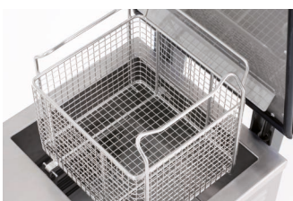
Baskets can be hung in and set up in the drip position