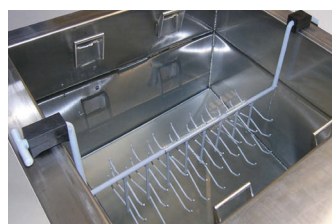
Product carriers for e.g. jewellery parts