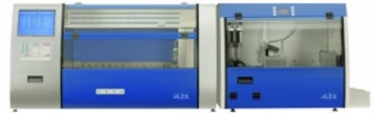
Stainer MAS in combination with Cover Slipper MCS